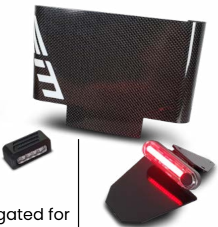
LED kit : not homologated for road use (option).