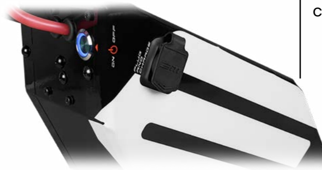
Battery with new charging socket cover.