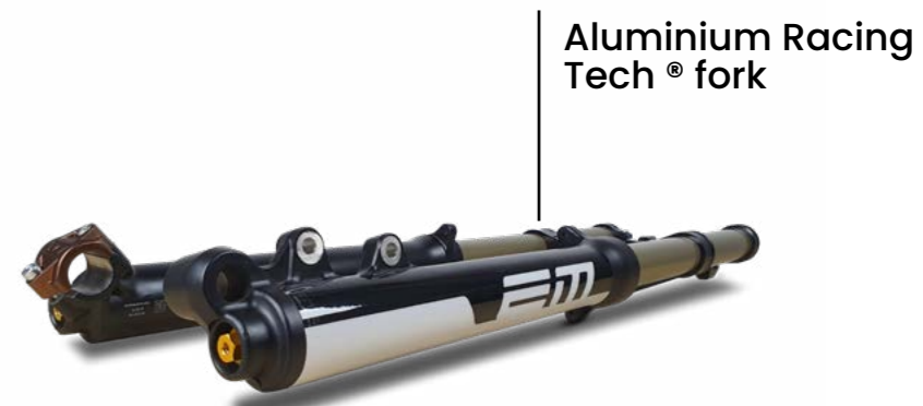
Aluminium Racing Tech® fork