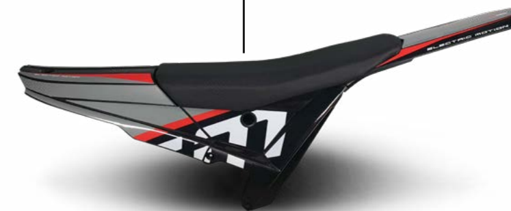
New design for the battery top cover and the seat.