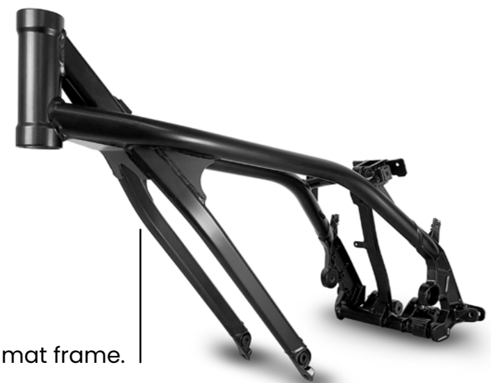
Black mat frame.