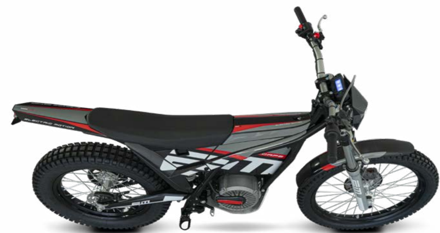
Escape battery with large range (2.6 kWh).