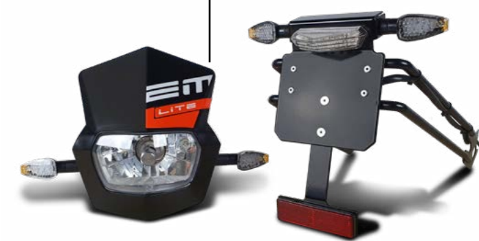
Road legal kit (125cc).