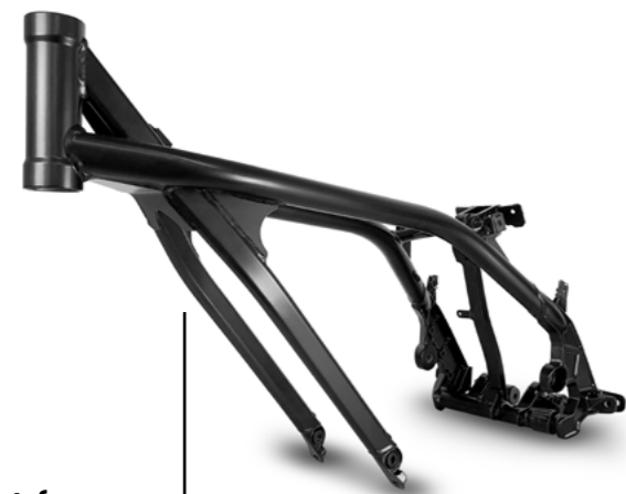
Black mat frame.